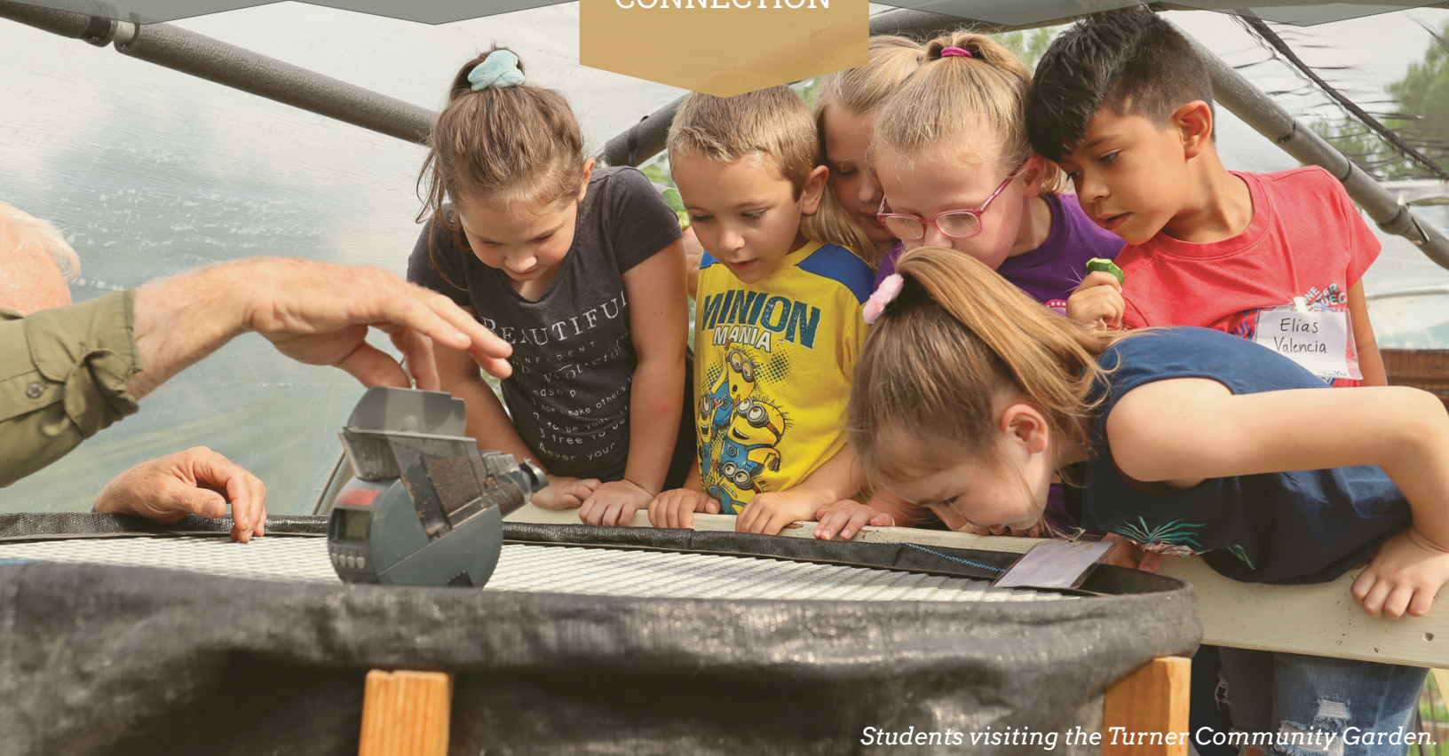
Students visiting the Turner Community Garden.

Goal Statement: In TUSD 202, we will collaborate with a diverse group of community stakeholders to enhance educational opportunities and increase engagement in our schools through mutually beneficial partnerships, opportunities for input and feedback, and community outreach.